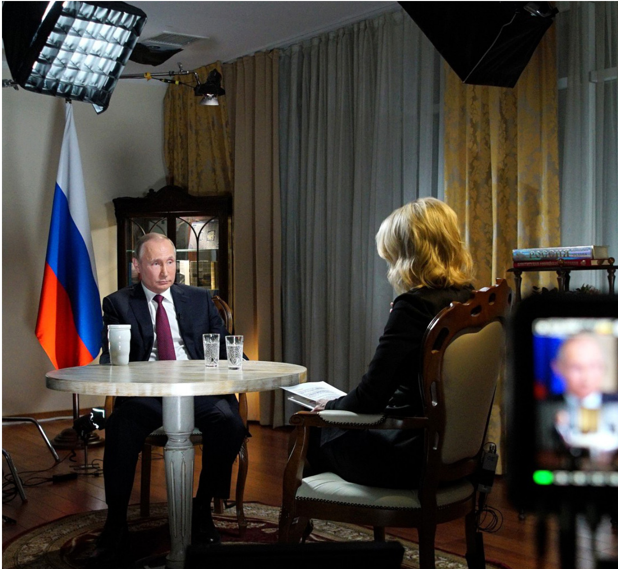
Russian President Vladimir Putin.

West. Finally, these measures must all go hand-in-hand with coordinated economic sanctions and be backed up with Western military power.