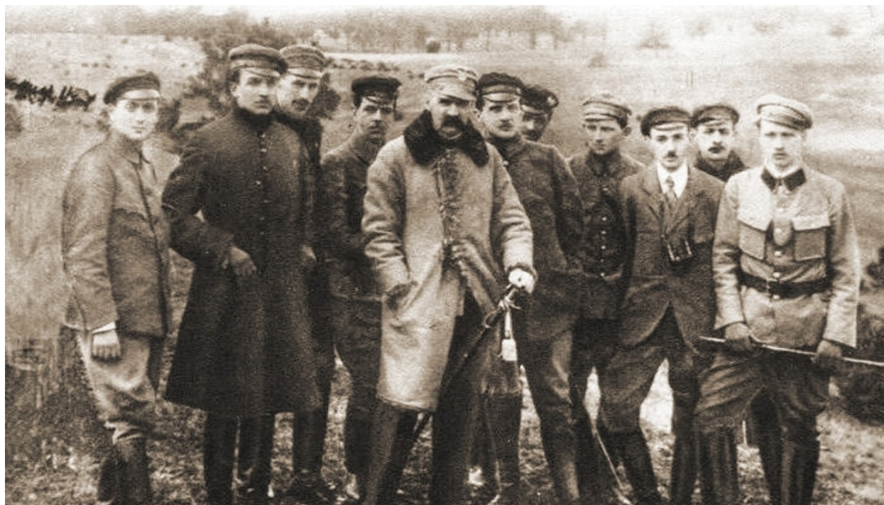
Józef Piłsudski with Supreme Command of Polish Military Organization in 1917.

aggressive Bolshevik state at bay was his goal. Unfortunately, Piłsudski's Prometheanism may have had unintended, adverse consequences: It probably informed the USSR's own subsequent strategy of exploiting its opponents.