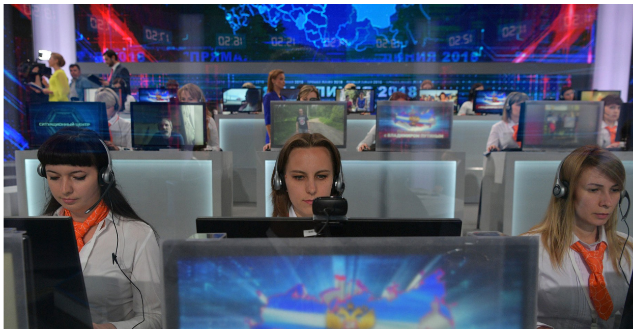
On the set of the annual television program “Direct Line with Vladimir Putin.”