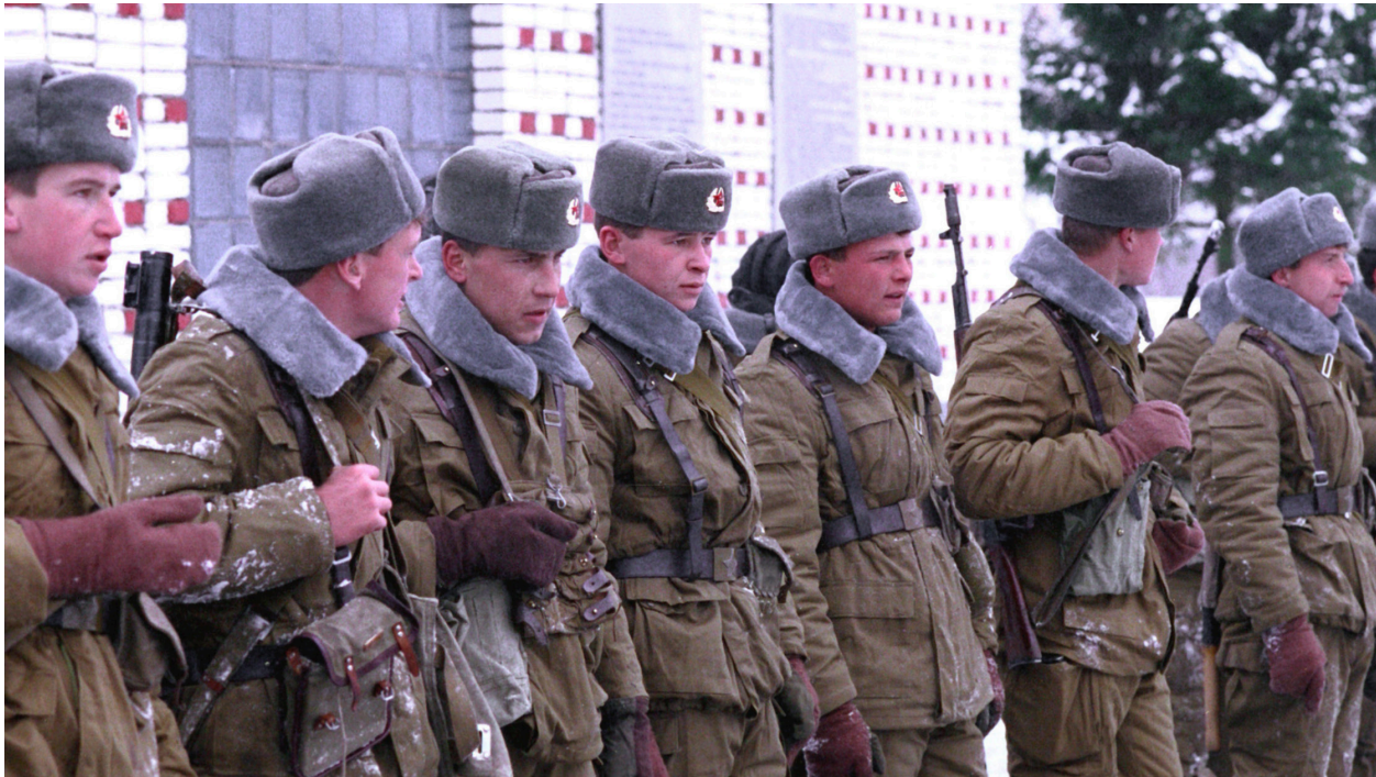
A Soviet platoon in 1992.

Hard power still matters. The Kremlin has thus invested heavily in modernizing its armed forces. Its purpose is to thwart Washington's ability to project power into Moscow's self-proclaimed sphere of influence. Russia's military, although no match for the United States on paper, carries out frequent large-scale exercises. It is capable of conducting high-intensity warfare at short notice across a narrow front against its neighbors and NATO forces. Lest anyone forget, Russian military aircraft regularly probe Europe's air defenses and execute dangerous maneuvers around Alliance warships, risking an escalatory incident. Here too, hard power capabilities (and their use) are a means to an end. Abroad, they assert the impression of Russia's Great Power status. At home, they generate strong political benefits to the regime in the form of enhanced public support. 69