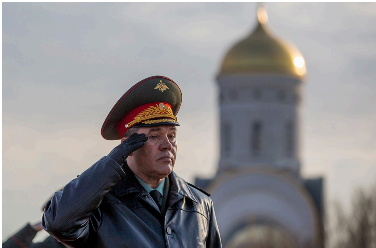
Russian Chief of the General Staff Valery Gerasimov.

While discussing the Arab Spring and NATO's intervention in Libya, Gerasimov highlighted,