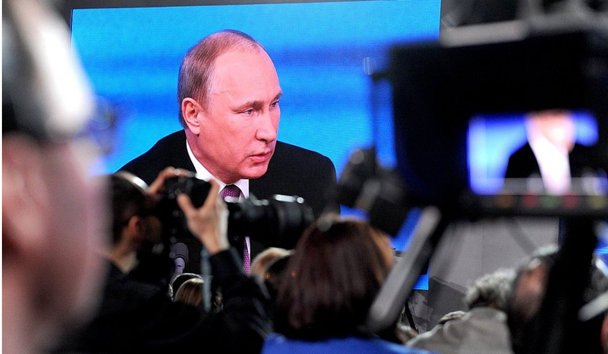
Russian President Vladimir Putin.

narratives. This is the bundling of multiple, even contradictory, arguments together. According to experimental research compiled by RAND, this “firehose” propaganda model is effective due to the variety, volume, and views of sources. 98 First, individuals are more likely to accept information when it is received through a variety of sources, despite ostensibly coming from different perspectives or different arguments which promote the same conclusions. Second, the persuasiveness of a message is more dependent on the number of arguments made than on their quality. Endorsements from large numbers of other readers (even bots) boosts an individual’s trust in the information received. Third, views from propaganda sources are more persuasive when the recipient identifies with the source, whether in terms of ethnicity, language, nationality, ideology, or other factors. “Credibility can be social,” RAND finds, as “people are more likely to perceive a source as credible if others” do too. 99