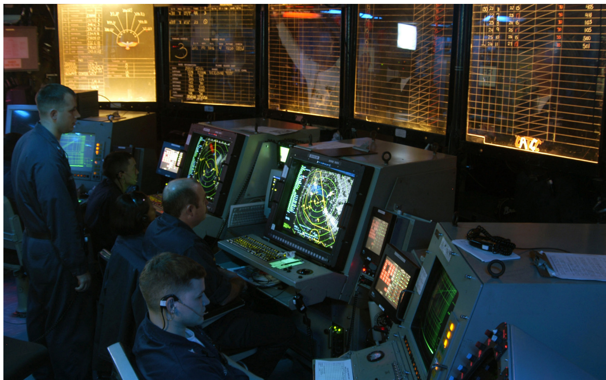
The United States Navy during a military training exercise.

Although Putin has escalated crises in order to escape them (see ‘Chicago rules’ earlier), he appears unwilling or politically unable to deescalate in a way that would not look like defeat. In this regard, the shadow of Mikhail