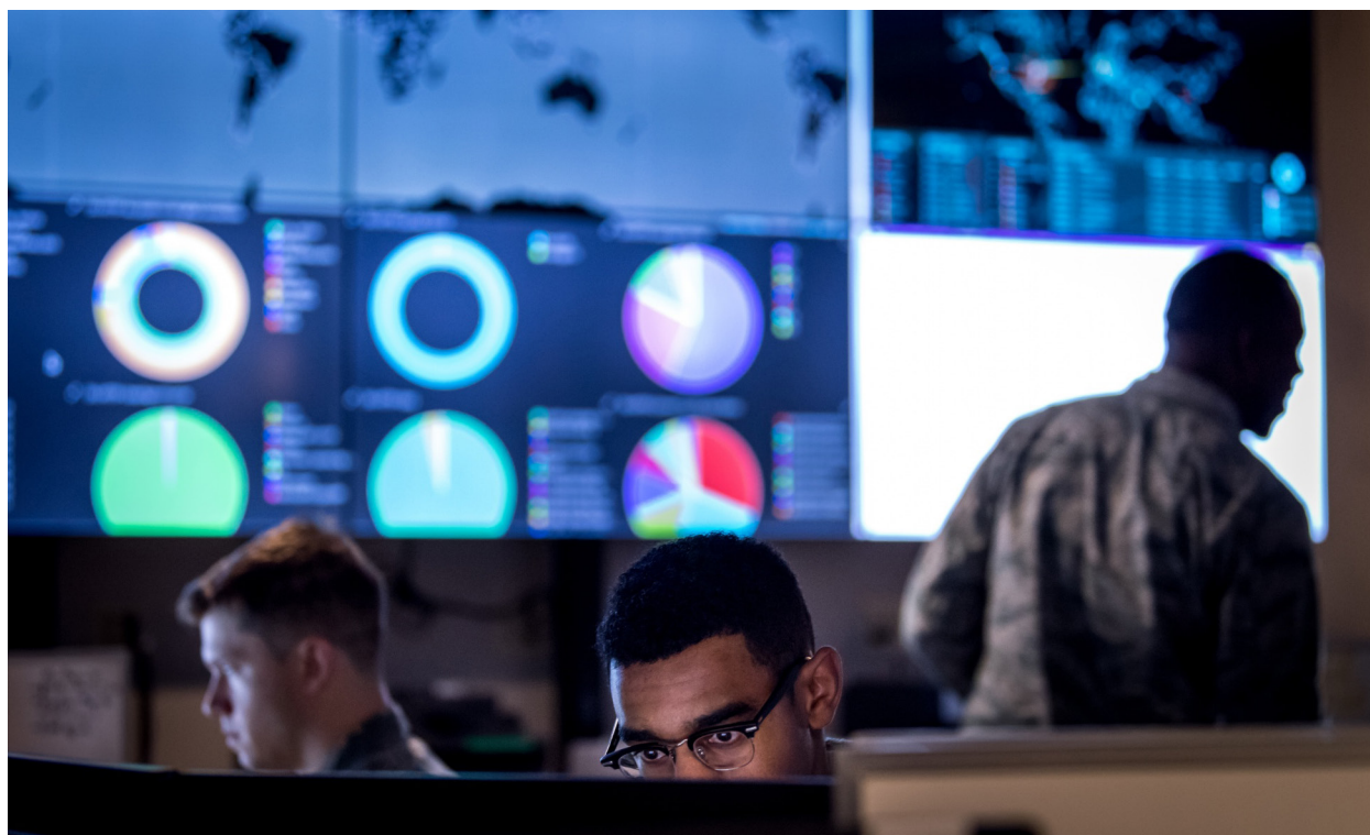
Cyber warfare operators with the Maryland Air National Guard.

Too much of the West's recent attention to Russia has been dedicated to granular considerations of the "whom" and "how" of Kremlin techniques for creating disorder and