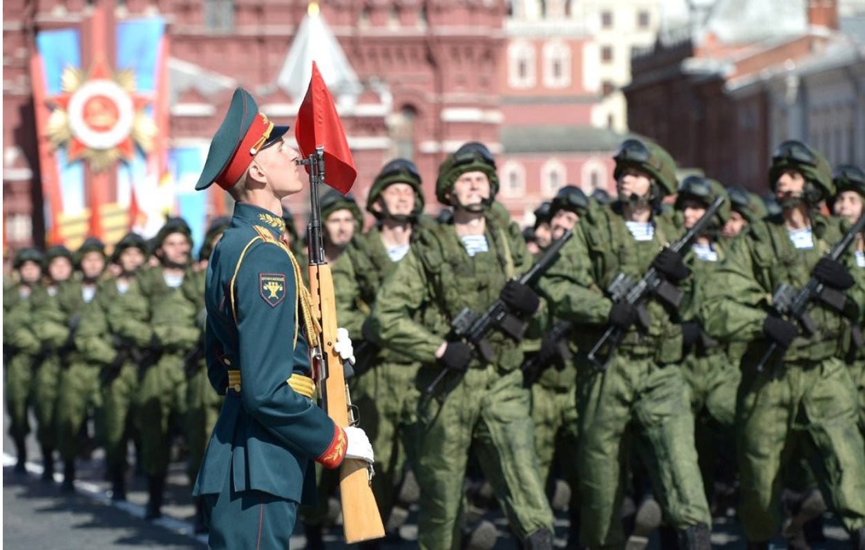
Russian Victory Day Parade in Moscow in 2014.

on surprise and uncertainty, Russia's use of disinformation erodes the trust that other countries or leaders might place in their relationship with Russia and Putin personally. The Kremlin has chosen to damage this trust. Russia has affirmed that its relations with other states are guided by zero-sum intimidation, not established rules, good faith treaties, or alliance structures. While these pillars of statecraft may have their own weaknesses, they evolved organically over time. They do not exist because the United States imposed them upon an unwilling world. Rather, they convey real and meaningful value to states which employ them in their relations with others. By undercutting international rules, treaties, and alliances, the Kremlin inadvertently eats away at its own standing in the world. Gerasimov failed to factor this crucial variable into his "doctrine." That failure is now imposing long-term costs on Russia's national interests.