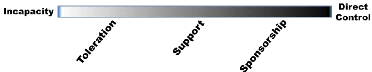
Figure 1. Spectrum Depicting the Level of Involvement Between a State Sponsor and a Terrorist Organization

The step beyond complete incapacity is “Toleration.” This occurs when the state is aware of terrorist activity within its borders and supports the terrorist agenda through willful inaction. The next level of involvement is “Support.” Here the state is actively providing a tangible form of support to the organization, but exercises no control over the organization’s actions. As the quantity and type of state support becomes increasingly valuable to the terrorist organization, the state begins to actively exercise a higher amount of control over the organization's activities and, in some cases, its ideology. This level is described as “Sponsorship.”